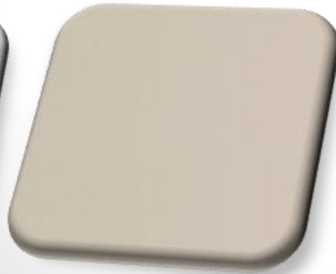
highlights in sand & taupe