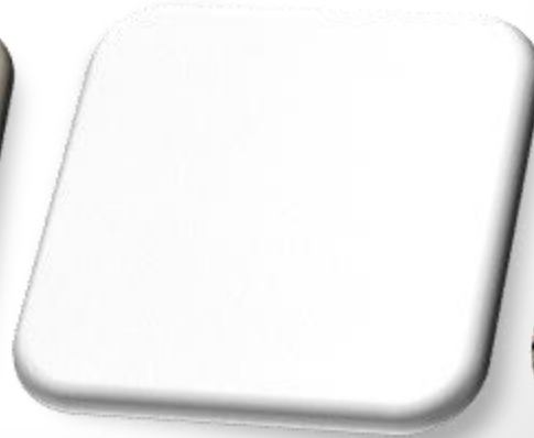
plain, white walls