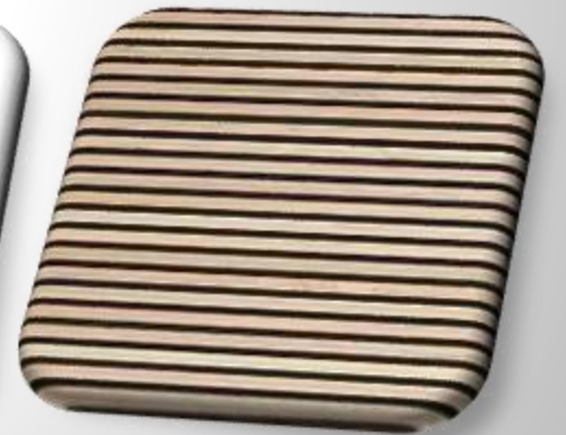
trendy lamella optic