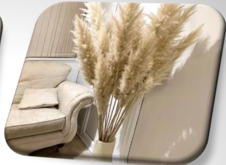
bright, cozy, natural